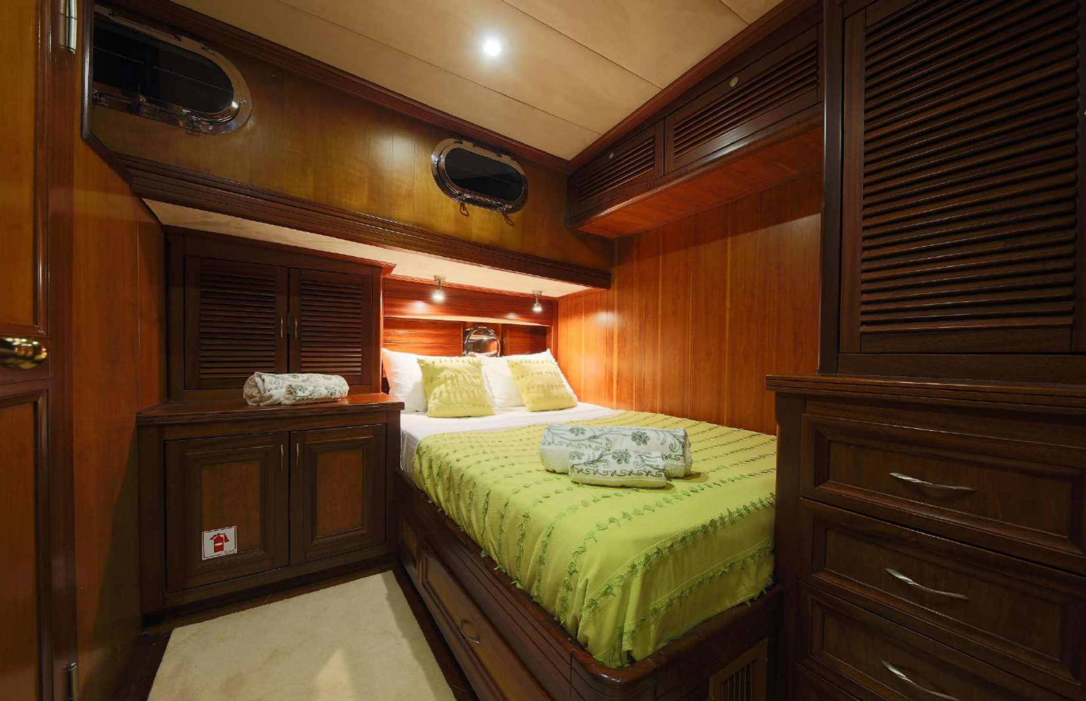
Starboard Side Double Cabin