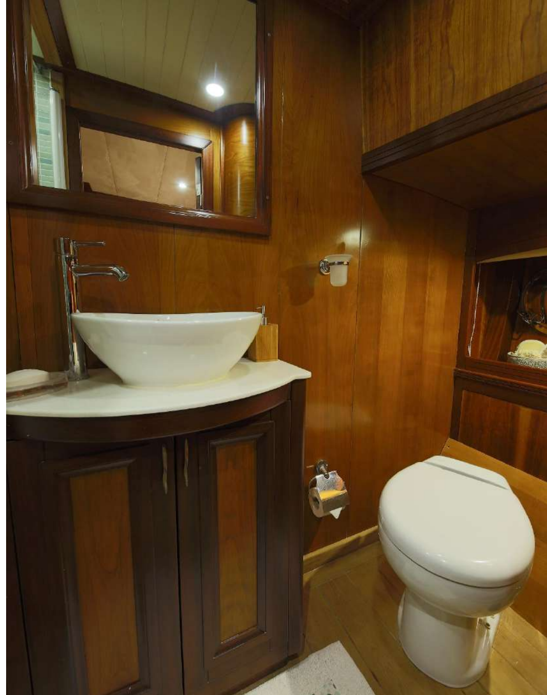
Double Cabin Bathrooms