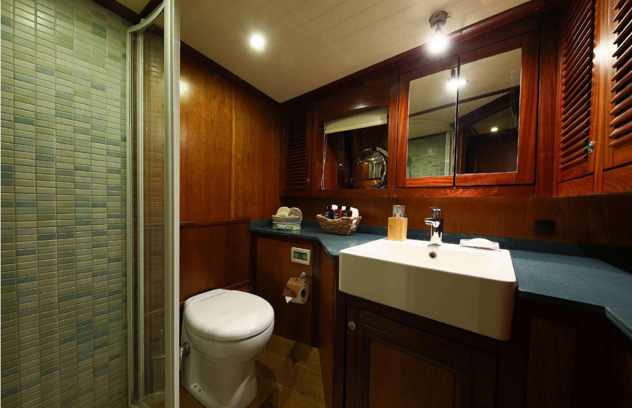
Aft Master Cabin Bathroom